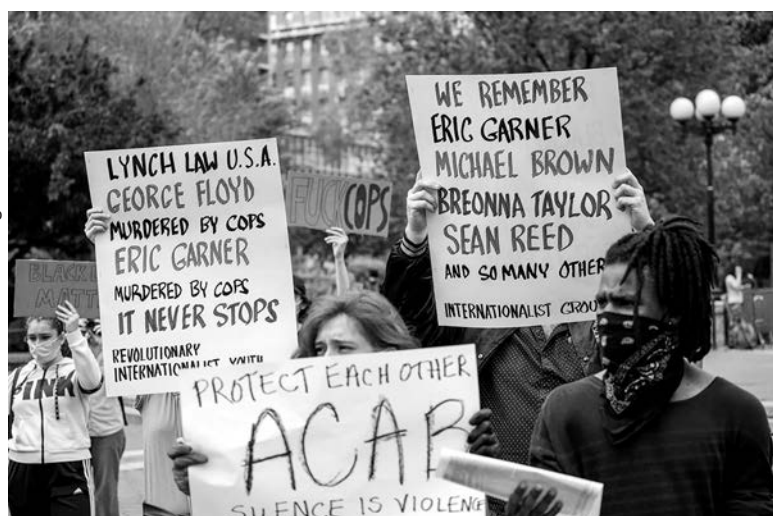
NYC protest, May 28, against cop murder of George Floyd.

endless list of African Americans and Latinos murdered by the police, in a country where racist repression is and always has been the linchpin of capitalist exploitation. This goes back to slavery days, when runaway slaves would be hunted down by squads of slave catchers. These patrols paved the way for modern-day police departments. In recent decades, the police and courts have ramped up mass incarceration, particularly of black men, while cops across the U.S. kill an average of over 1,500 civilians a year, with black men five times as likely to be gunned down by police as white men (see “Black America Under the Gun: Workers Revolution Will Avenge Philando Castile,” The Internationalist No. 48, May-June 2017).