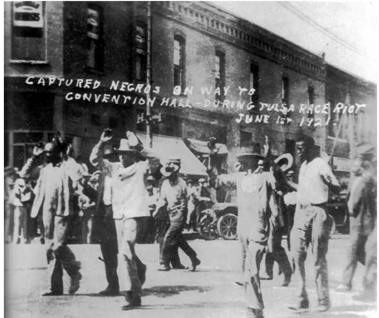
Tulsa, Oklahoma, 1 June 1921: Hundreds of black men were seized at gun point and marched to detention centers while vigilantes burned down the black community of Greenwood.

– the cops and prosecutors, the courts and prisons – were given the green light to be the blunt instruments of social control of that oppressed population. The niceties of rights were simply disregarded as the cops rode roughshod over the residents who were viewed as actual and potential criminals. That’s how a 12-year-old boy, Tamir Rice, gets gunned down in Cleveland by a cop who starts shooting as soon as he sees the child. The cop knew he would get off – not even a trial. 3