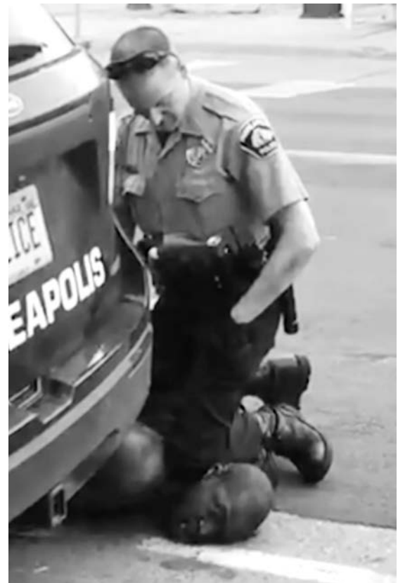
Minneapolis cop knees George Floyd, killing him, 25 May 2020.