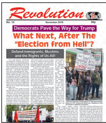
Revolution, newspaper of the CUNY Internationalist Clubs