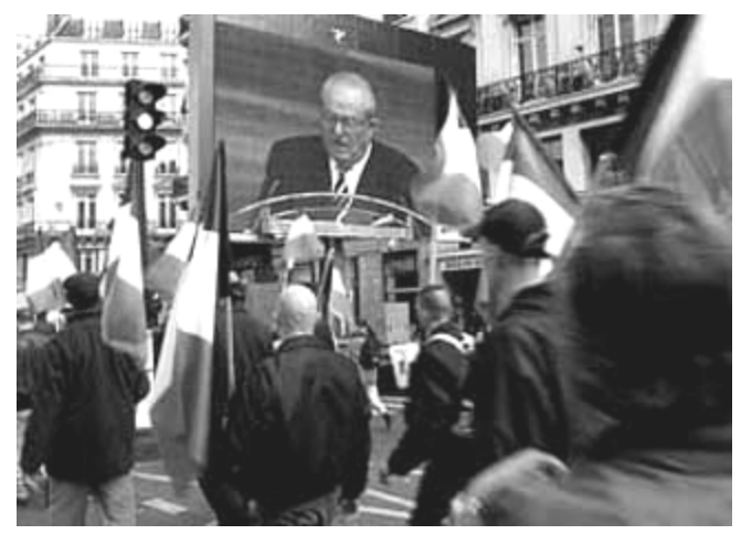
Nothing "ex-" about these fascists. Skinheads march before screen showing National Front Führer Le Pen at 1 May 2002 FN mobilization in Paris.

Now the battle is on for the legislative elections, June 9. Even though Chirac got barely one-fifth of the votes on April 21, this won't stop him from striking a pose as "savior of the nation," affecting a cheap imitation of his former patron, General Charles De Gaulle, the bonapartist strongman who erected the presidential Fifth Republic. Le Pen's National Front is expanding even as new witnesses come forward accusing him of