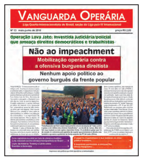
Vanguarda Operária, newspaper of the Liga Quarta-Internacionalista do Brasil

Order from/make checks payable to: Mundial Publications, Box 3321, Church Street Station, New York, New York 10008, U.S.A.