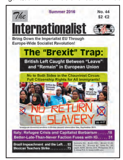
The Internationalist, magazine of the Internationalist Group/U.S.