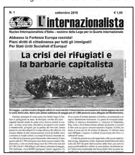
L'internazionalista, newspaper of the Nucleo Internazionalista d'Italia