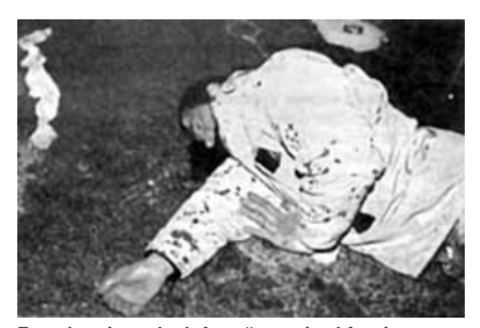
French unions don't face "organized fascist gangs attacking workers' picket lines"? False. Left: striking drivers in Vitrolles, near Marseille, were assaulted by squad of National Front thugs during national truckers strike, 5 November 1997.

European capitalists look with envy at the destruction of the British unions that began with Margaret Thatcher's breaking of the 1985-86 coal strike. As French bosses close one plant after another, French unionists are constantly facing gangs of professional strikebreakers linked to the FN/DPS and other fascist outfits. Among these "security companies" are the AGS, Ambassy, Bègue Consultants, Éric SA, Groupe Onze International, Groupe Onze France, Normandy, OGS and SPGM. They supply the same thugs who beat up leftists and immigrants outside National Front