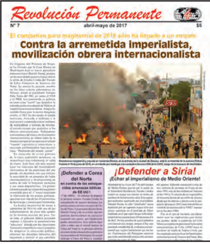
Revolución Permanente, newspaper of the Grupo Internacionalsita/México