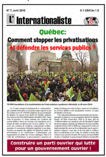
L'Internationaliste, organ of the League for the Fourth International