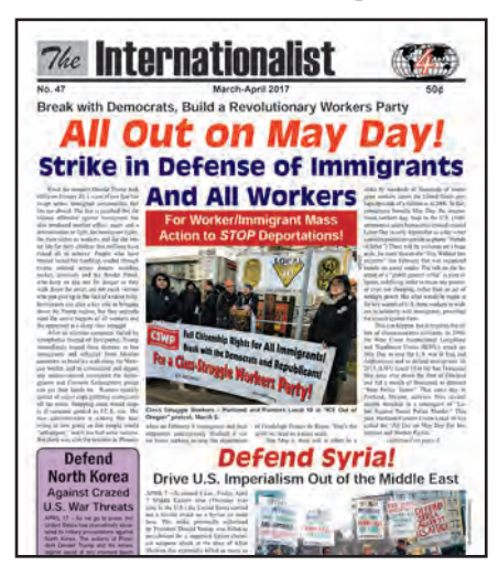
The Internationalist, newspaper of the Internationalist Group/U.S.