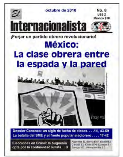
El Internacionalista, organ of the League for the Fourth International